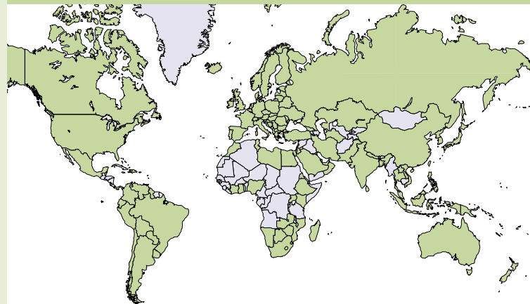
■ Nations in which CFA charterholders and/or candidates reside

Accordingly, AIMR takes great effort to build a global perspective into each level of the CFA Program’s curriculum. While candidates are responsible for understanding principles that are common to all markets, they must also demonstrate a working knowledge of topics as they relate to global investment strategy. This gives CFA charterholders an advantage when implementing global strategies or working with clients outside the nations in which they work.